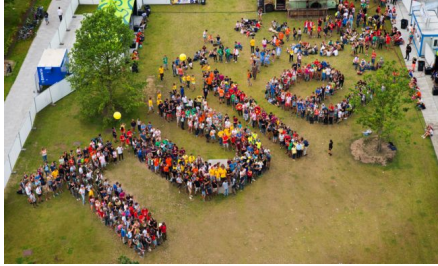
Figure 2: A View of a Nice City.